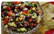
The Elegant Farmer Black Bean Salad