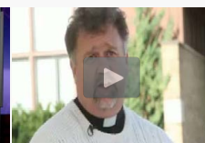
Drive-thru prayers in Glendale