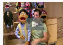
Behind the scenes: Puppetry in 'Avenue Q'

Browse the latest JSONline video below and find more on our video home page .