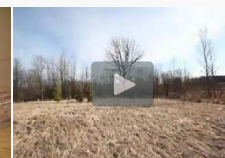
Our search for hidden hunting lands