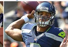
Russell Wilson with the Seahawks