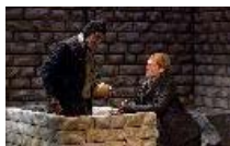
This 'Hamlet' packed with surprises