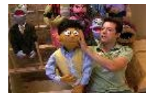
Behind the scenes: 'Avenue Q' puppetry