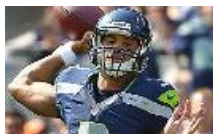
Russell Wilson with the Seahawks