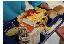
Lunch changes upset Mukwonago High School students