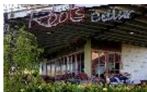
Iron Horse owner to open restaurant