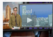
Land and Space: Northwest side business district tax