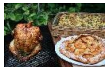
Beer can chicken will make you smile